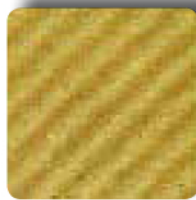
Raku Cone 10 - Reduced