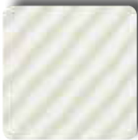
Raku Cone 04

Coarse Red has all the great characteristics of our Coarse White body but is slightly more plastic. Like Coarse White, it can easily be used on pieces over four feet tall. A warm orange-brown color in cone 06 electric kiln firings. Brick-brown color at cone 4. Not recommended for reduction firing.