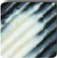
Raku Cone 04 - Reduced