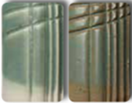
Retro Blue Green GC842