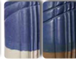
Fiesta Blue GC848