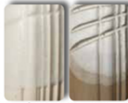
Satin Matte White NEW GC831