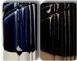
Dark Cobalt Blue GC612