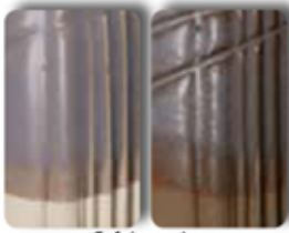
Soft Lavender GC721