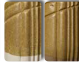
French Mustard GC846