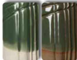
Luster Green GC728