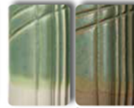
Lichen Green GC840