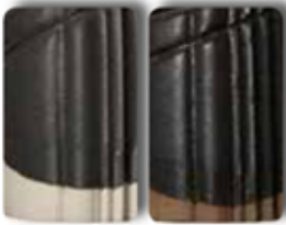
Graphite Black GC850