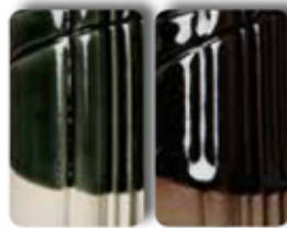
Emerald Green GC616