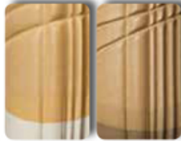
Caramel Cream GC844