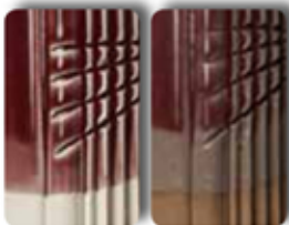
Rouge Red GC624