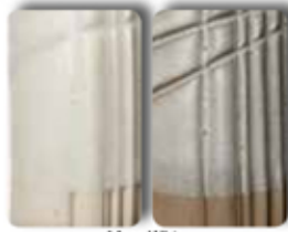
Matt White GC830