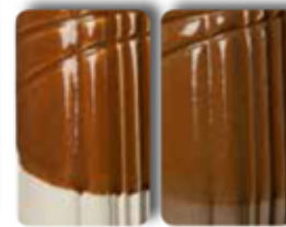
Copper Brown GC620