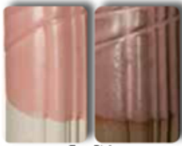
True Pink GC718